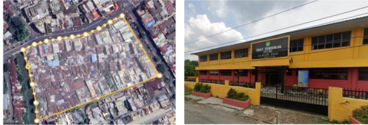
Figure : Research Site (1) Aur Village, (2) Elementary School 060902