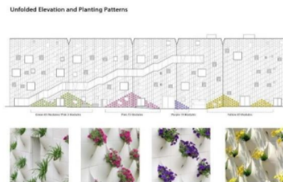
Figure 4: Building Exterior of Flower + Kindergarten / OA-Lab

This building has a height of 6 floors with the characteristic feature of presenting plants located on the building facade so that it can also function as an aesthetic element of the building. This becomes an interesting focal point for those who see it.