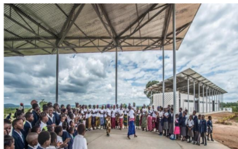
Figure 9: Atmosphere in Multi-Function Room in Chipakata Children's Academy

This building has a roof that juts out and there is also space above the roof that can be used as a classroom. The slope of the roof corresponds to the sun's orientation towards the building, which means the room does not get hot.