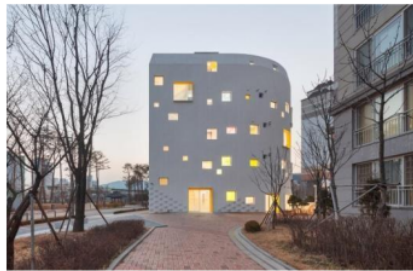
Figure 3: Building of Flower + Kindergarten / OA-Lab

Referenced from the web page https://www.archdaily.com/782889/flower-plus-kindergarten-oa-lab?ad_medium=gallery . Flower Kindergarten is in the city of Seoul, South Korea. Designed by architect Jungmin Nam in 2015, this is an effort to create child-friendly educational facilities on limited land.