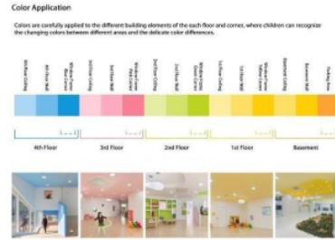
Figure 5: Building Interior of Flower + Kindergarten / OA-Lab

The use of bright colors is highlighted as a design element, and is used as a space-forming element. The different colors indicate the differences between each function of the space created by the design efforts.