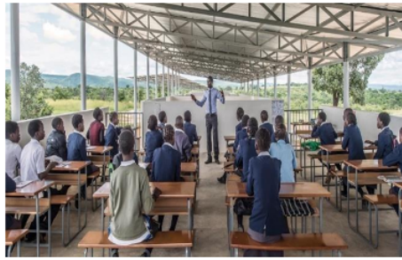
Figure 7: Learning Atmosphere in Chipakata Children's Academy