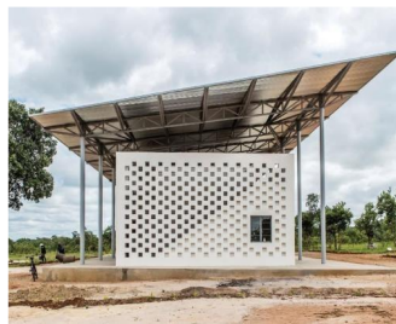
Figure 6: Building of Chipakata Children’s Academy

Referred to from the website https://www.archdaily.com/770497/chipakata-childrens-academy- ennead-architects .Chipakata Children's Academy was built in 2015, this building is a school designed with the aim of facilitating access to education for area residents left behind and underdeveloped.