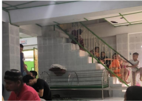
Figure 10: Children Activities in Masjid Jami'AUR area